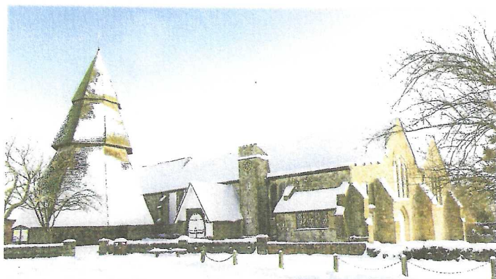
St Augustine Brookland