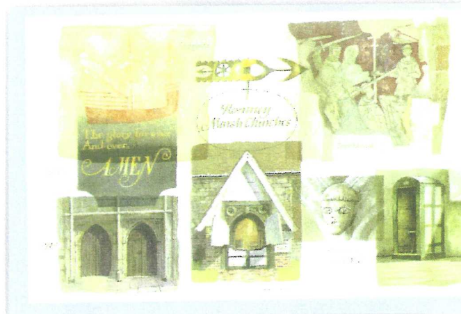
Romney Marsh Churches From a watercolour by Clifford Bayly RWS 12 x 18.5 cms (4¾ x 7¼ ins)