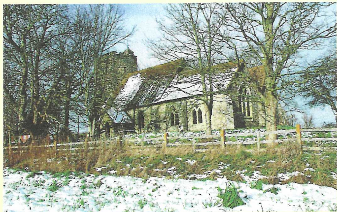
St Augustine, Snave 12.8 x 20.5 cms (5 x 8 ins)